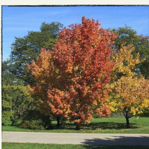
Red Maple Bowhall