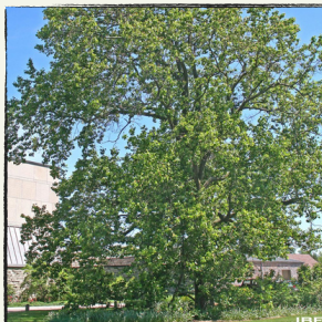
Tulip Tree Emerald City