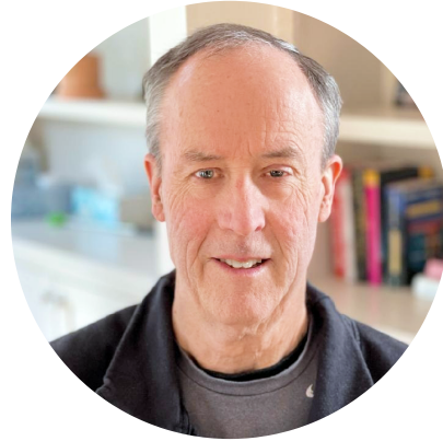
Mayor Tim Collopy

If you have questions or comments, please contact me at: