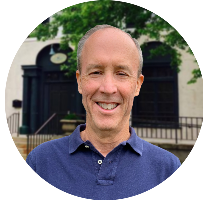
Mayor Tim Collopy

If you have questions or comments, don't hesitate to contact me at: