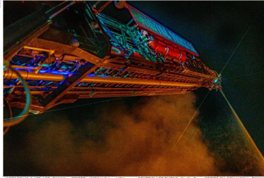
—INSTAGRAM BART LES SWANK — BRISTOL, WISC U.S.A. — NOV. 2019 — CONTROLLED BURNS B.F.D. — SERIES BY BENJAMIN L SWANK—