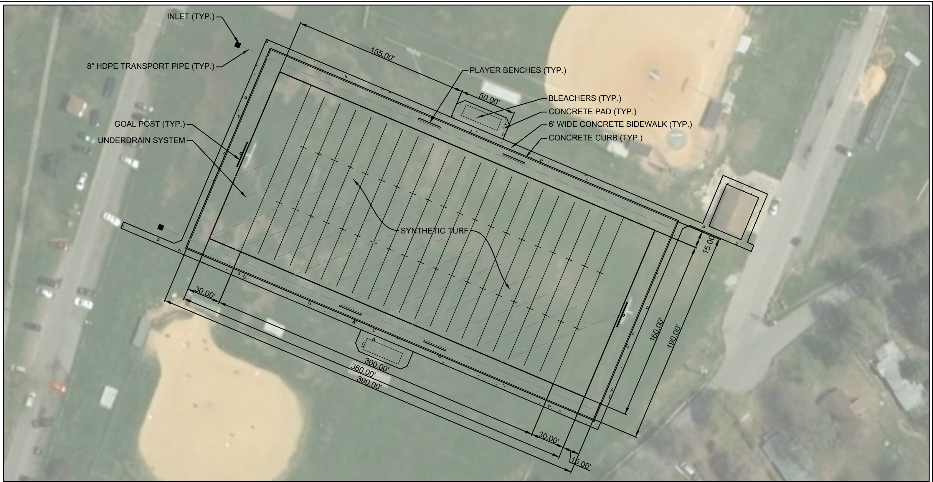
IRON WORKS SYNTHETIC TURF FIELD