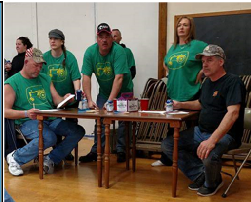
Dartball team Gordy's Kids watch as team member tries to get a hit at annual dartball tournament on April 2nd

FISS & BILLS 865 S. Westhaven Dr. Oshkosh, WI 54904