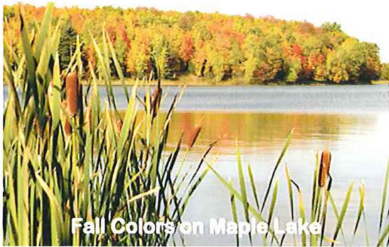
Fall Colors on Maple Lake