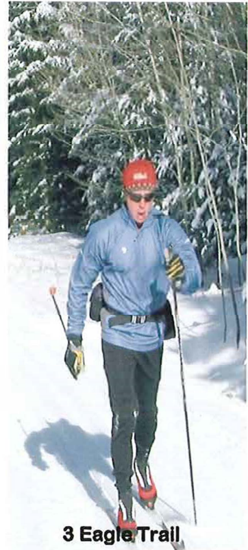
3 Eagle Trail

Three Lakes: Our world whispers quality of life!