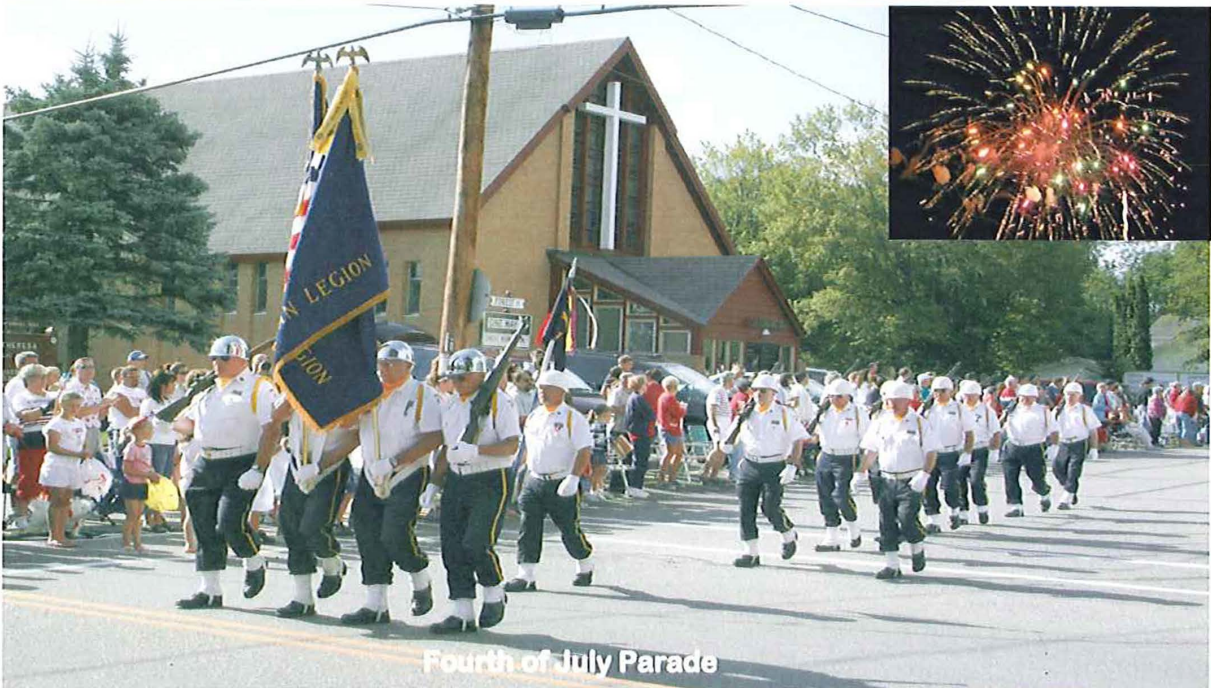
Fourth of July Parade

'Reeds-Spirit Lake' Outside Cover design compliments of Renquist Design, Inc. Racine, WI, 262-634-2351.