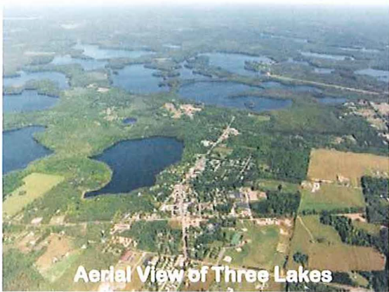
Aerial View of Three Lakes