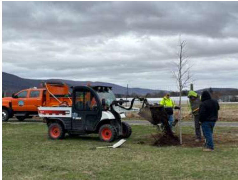
COPAKE'S HIGHWAY DEPARTMENT PLANTING NATIVE TREES