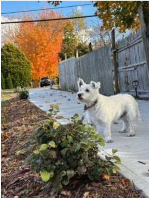
NATIVE PLANTINGS ALONG SIDEWALK FROM TOWN PARKING LOT (WITH EV CHARGERS) TO THE COPAKE GRANGE WITH EX OFFICIO CAC/CSC MEMBER GUS BOYLE-MENDE PROVIDING OVERSIGHT

In addition to the above specific action items, the CAC and its members have continued to support these CAC subcommittees: