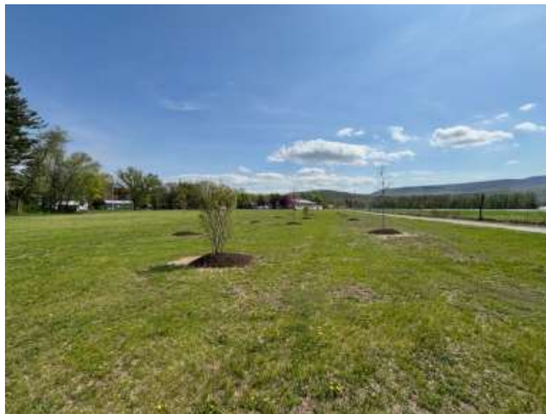
THE 13 NATIVE TREES (9 Red Oak, 2 Shadbush and 2 Redbud)