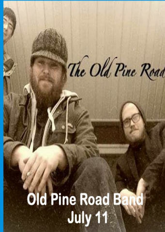
Old Pine Road Band July 11