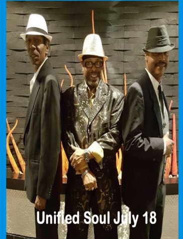
Unified Soul July 18