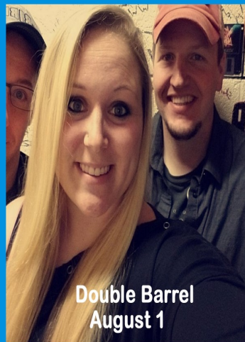
Double Barrel August 1