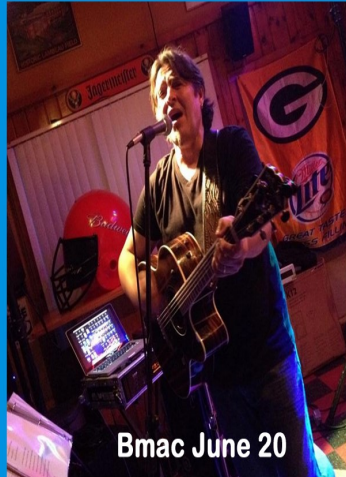
Bmac June 20

Wednesday Evenings, 7pm to 9pm, next to Peepleslures Rain Back-Up Location, Boulder Junction Community Center