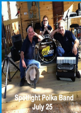
Spotlight Polka Band July 25