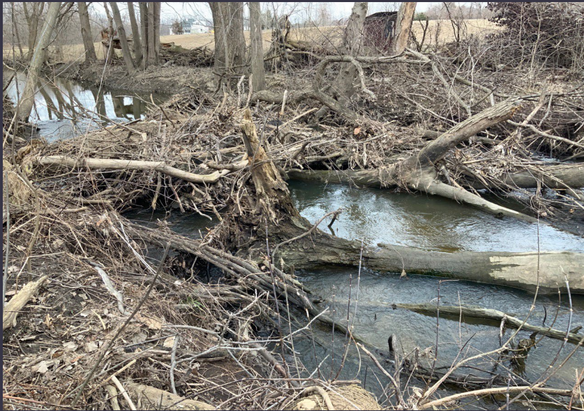
Debris and Log Jam Obstructions