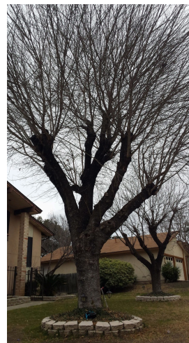
An overpruned tree will put out suckering growth in order to get more foliage out and survive.

Tree growth is controlled by hormones, and if we prune too much at once, the hormonal imbalance can lead to epicormic growth (also called suckering.) This is what happened when trees were “topped” years ago under utility lines. This is no longer a standard practice.