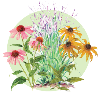
Brown-eyed Susan Purple coneflower Switchgrass