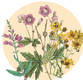
Wild geranium Lance-leaved coreopsis Obedient plant