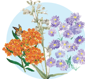
Butterfly weed Aromatic aster Foxglove beardtongue