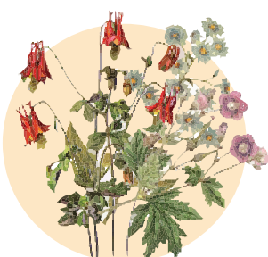
Wild geranium White wood aster Eastern Columbine