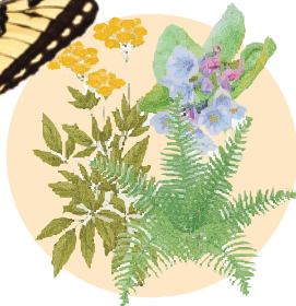
Golden Alexander Virginia bluebell Ostrich fern

Suggested flower combos to support birds, butterflies, and other pollinators