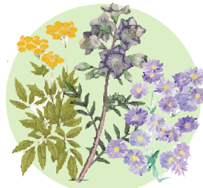
Jacob's ladder Golden Alexander Blue wood aster