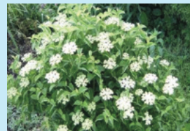
Southern arrowwood viburnum