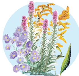
Blue wood aster Spike gayfeather Blue-stemmed goldenrod