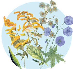
Cranesbill Gray goldenrod White wood aster