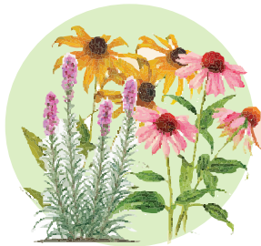
Orange coneflower Purple coneflower Spike gayfeather