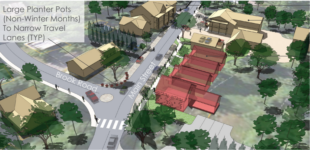
Crosswalks and Traffic Calming (View Looking South)

The existing Main Street bridge across Freeman's Brook provides a well-defined gateway into the village core. There are opportunities to visually enhance this important bridge feature. Connecting the village area between the commercial and civic core, this bridge spans the river that meanders through village. Historically the bridge was a character-defining element in the village core. Currently, the roadway and sidewalk area are not clearly defined, it is not illuminated and there is no consistency to its treatments at each of the four corners.