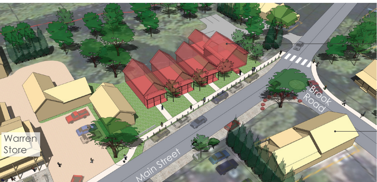
Additional Parking Opportunities (View Looking Northwest)