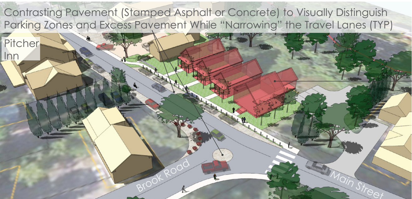
Potential Infill Development (View Looking West)