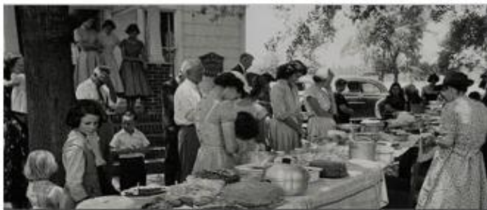
Spring Potluck Meeting

For over 20 years, Ellison Bay Arts has continued to provide beautiful creations to nourish bodies, hearts, and minds with fine art, fine craft, education, artisan food and drink. Go north to Ellison Bay to enjoy the best view in Door County. Rich in the tradition of arts and crafts, Ellison Bay is home to artist studios/galleries that feature pottery, original paintings, photography, wearable art and handmade leather items. There is also a cider house, coffee house and a folk school.