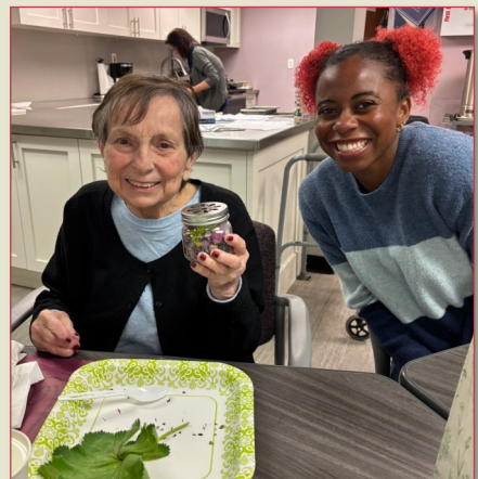
ADP Participants and Interns enjoyed spending time together crafting and getting to know each other