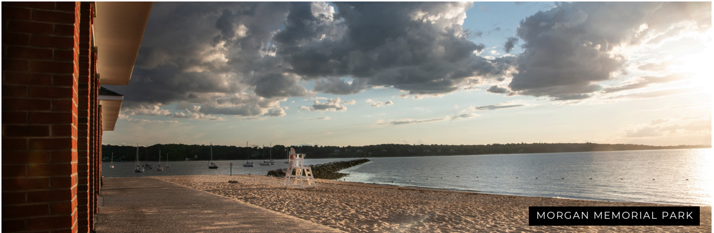
MORGAN MEMORIAL PARK