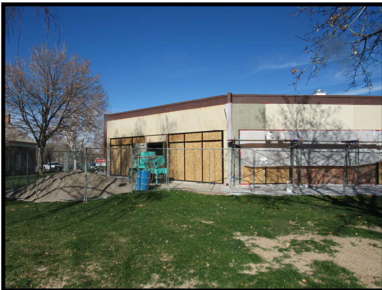
2020 renovations to the Pod