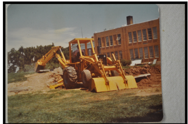
Construction begins on the Pod