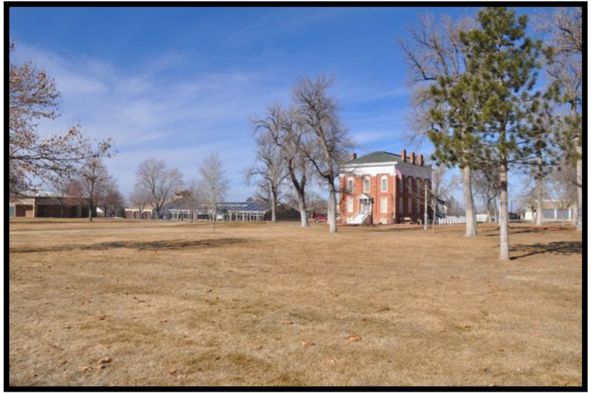
Pod building – far left

Today the building is part of the Territorial Statehouse State Park and once again under major renovations. It is scheduled to be completed by the first of June. It will have windows and glass doors so there will be more natural lighting. The restrooms will be refinished and will include new showers. The entire building will get a new coat of paint and new flooring has been added. Stop by when it opens and take a look.