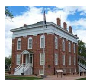
The Face of Fillmore