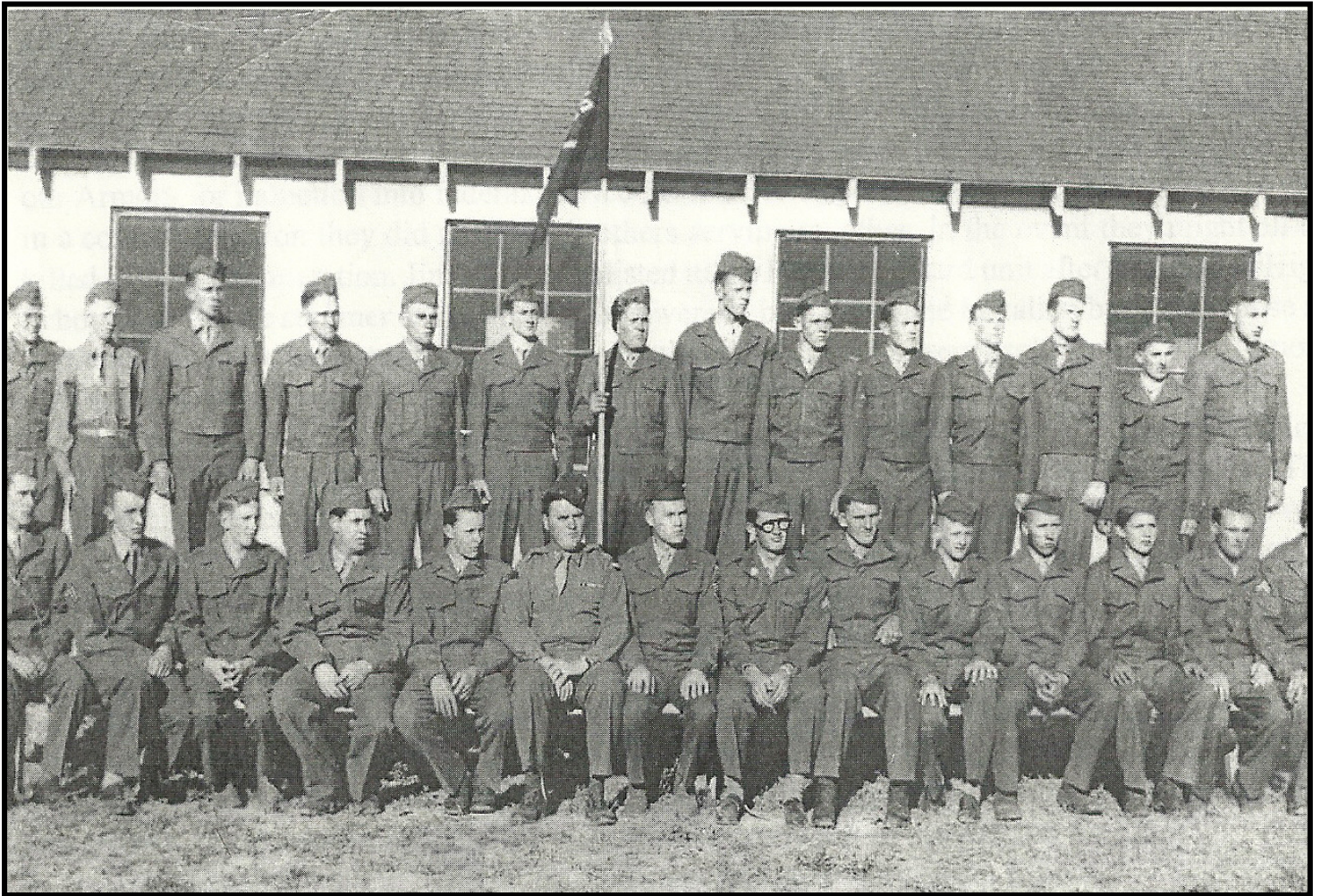
213 TH Charlie Battalion