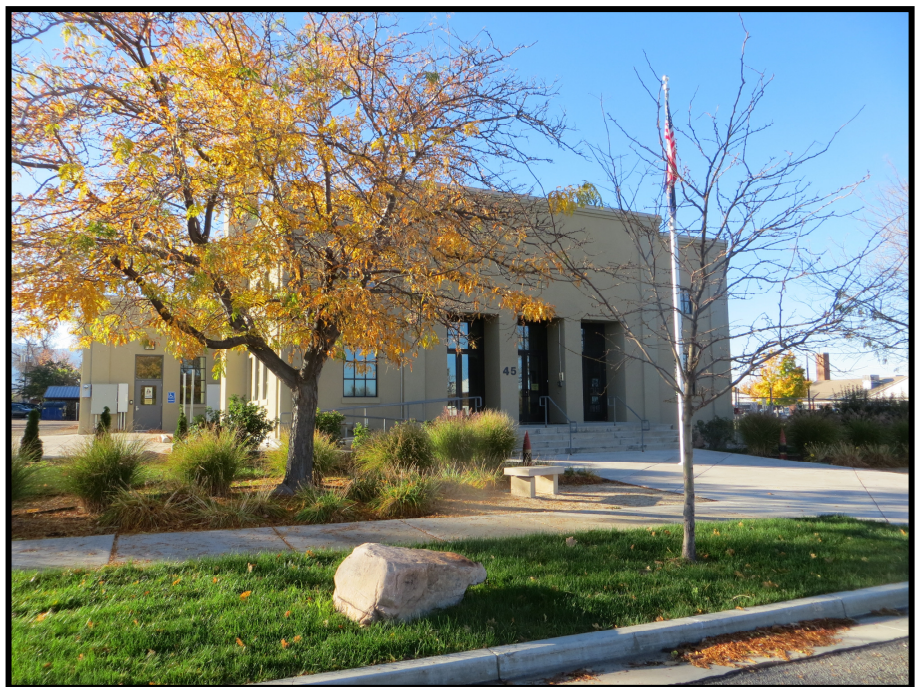
National Guard Armory in 2016