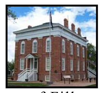
Face of Fillmore