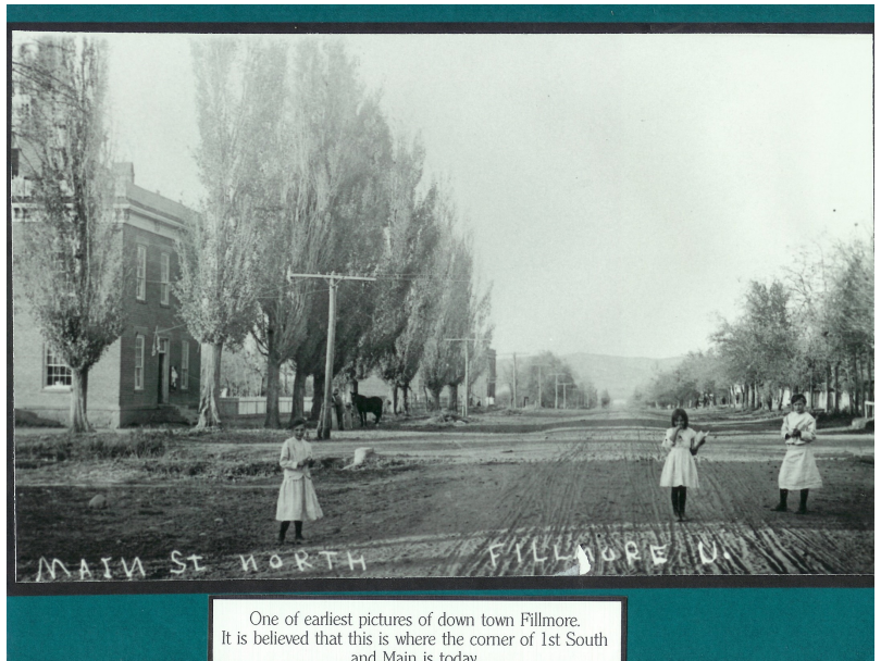
One of earliest pictures of down town Fillmore. It is believed that this is where the corner of 1st South and Main is today.

Watching the “destruction” this week prompted me to look back to some older pictures of Fillmore’s Main Street and share them with the readers.