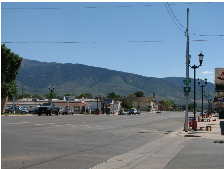
Main Street in 2009