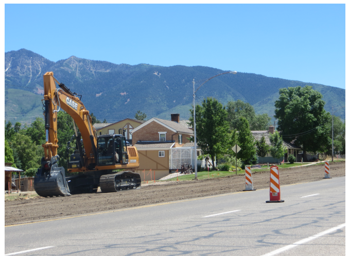
The current project in progress.