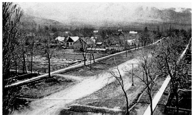
One of the first sidewalk projects on Main Street – about 1917