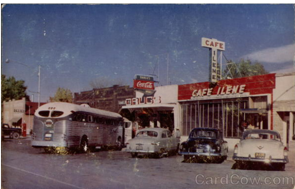
Businesses along a bustling Main Street

This is one of the first pictures of Main Street in Fillmore. I was told the rock in the street was the one Brigham Young told the people to move, but since the electric poles went in about 1918 and Brigham Young dies in 1877, I doubt it is the same rock.