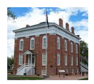
The Face of Fillmore