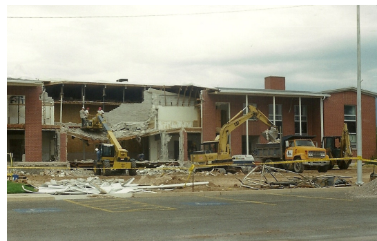
Fillmore Utah Stake Center