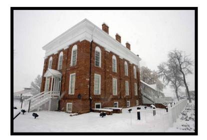
Face of Fillmore