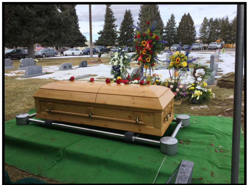
Cemetery pictures courtesy of David Wade