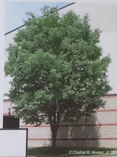
Green Vase Zelkova