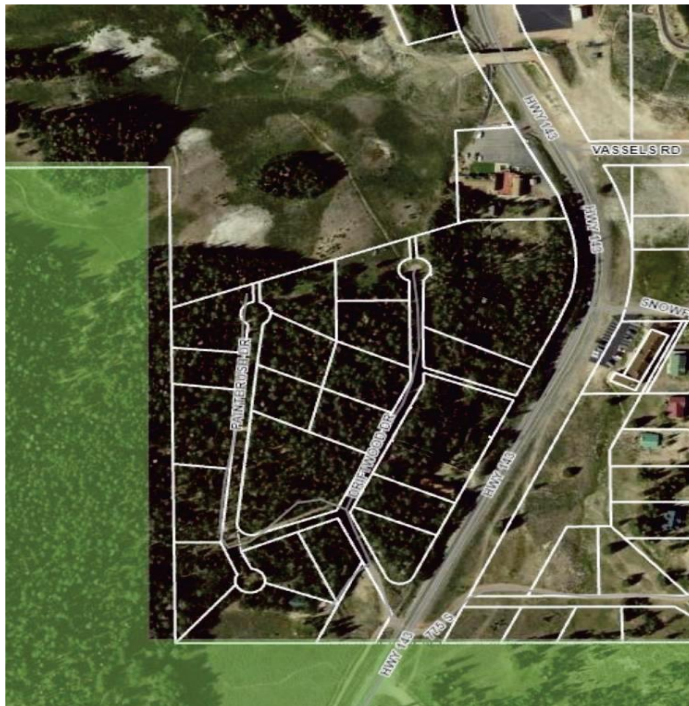
SAA Boundary Area