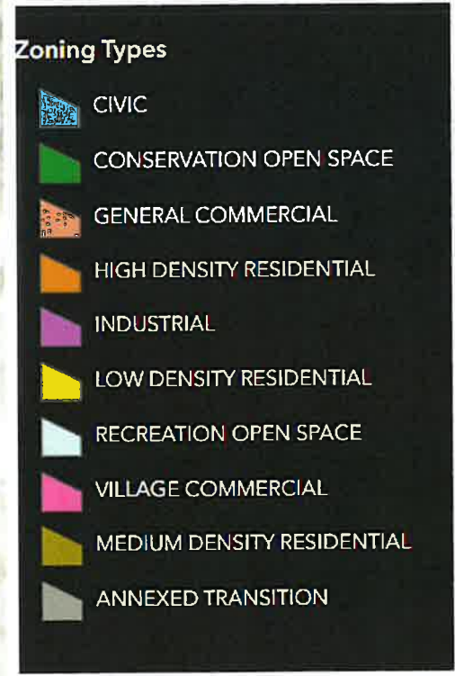
ASPEN MEADOWS ZONE DISTRICT MAP AMENDMENT - ANNEX TRANSION (AT) TO ASPEN MEADOWS MOUNTAIN ZONING - APRIL 28, 2026

Commented [NL1]: Aspen Meadows Proposed Zone Amendment (Gray section)